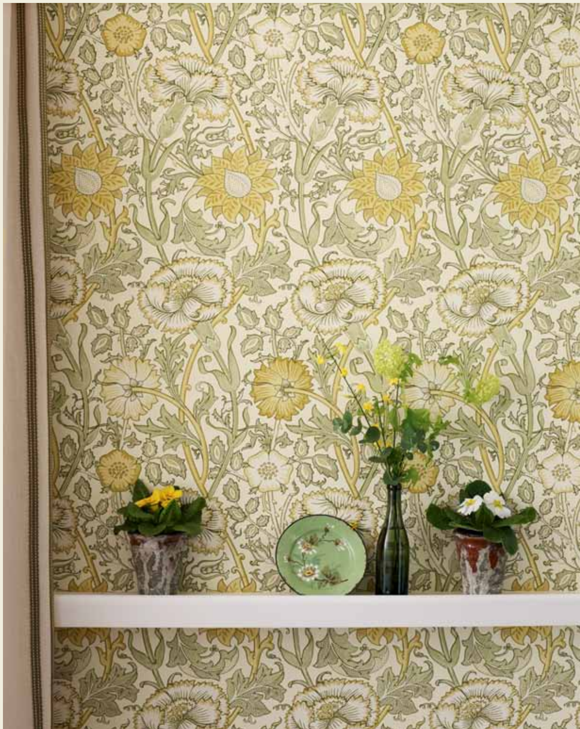
ABOVE WALLPAPER Pink and Rose 212569 CURTAINS (just seen) Ruskin DRUSRU317 trimmed in Sanderson Picot Braid 232196 WOODWORK Sanderson Silverflake 47-7P LEFT CHAIR Pink and Rose 222530 piped in Ruskin DRUSRU306 wwCURTAINS as above CUSHION Ruskin DRUSRU324 trimmed in Sanderson Flanged Cord 232274 WALLPAPER & WOODWORK as above.