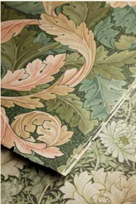
LEFT, BELOW & RIGHT Original wallpaper documents from the Morris & Co. archive

All Morris & Co. prints and wallpapers are designed and made in the UK by highly skilled craftsmen and women with meticulous care and scrupulous attention to detail.