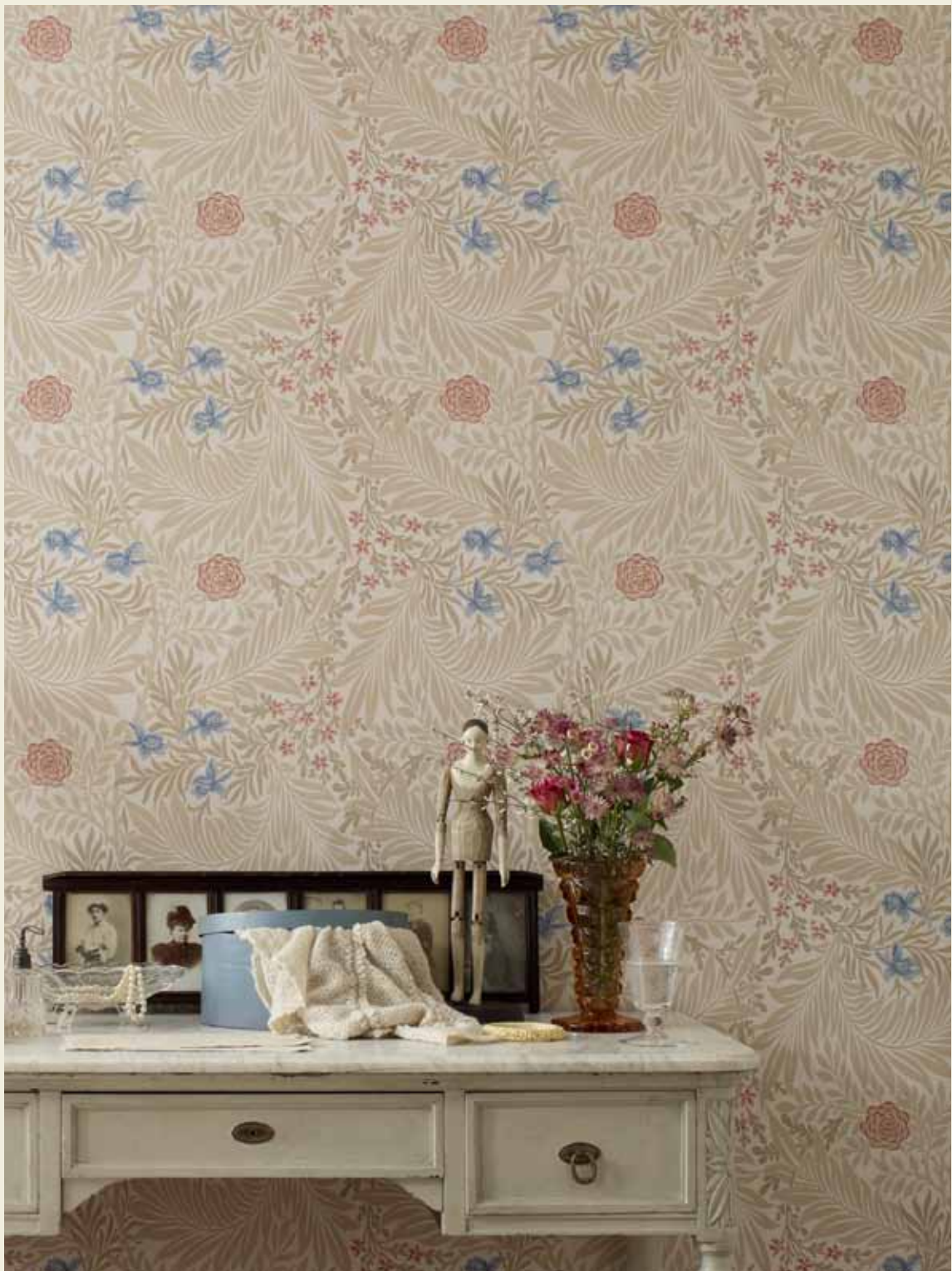
ABOVE WALLPAPER Larkspur 212557 RIGHT WALLPAPER Bird and Pomegranate 212538 WOODWORK Sanderson Dusky White 4-13P