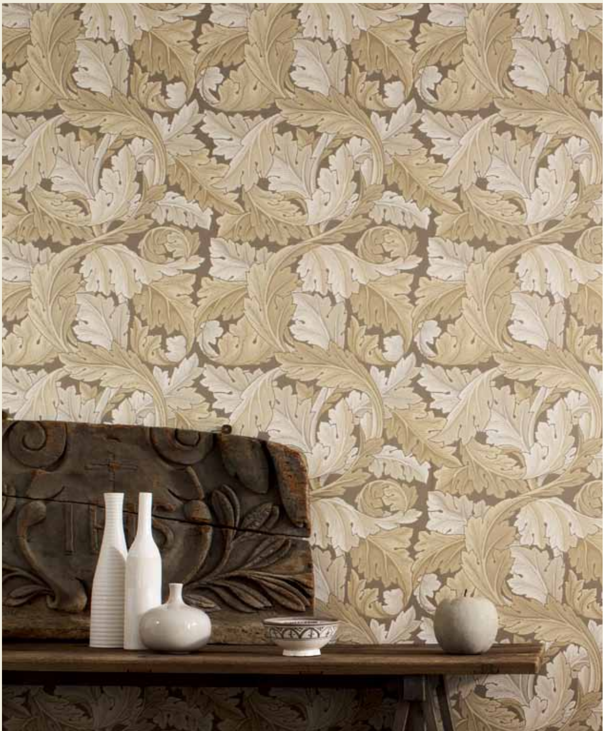
ABOVE WALLPAPER Acanthus 212552 RIGHT WALLPAPER Chrysanthemum 212548, CHAIR Woodford Plaid DMORWP302 piped in Ruskin DRUSRU322, CUSHION Branch 230275 bordered in Ruskin DRUSRU301, THROW Woodford Check DMORWC301