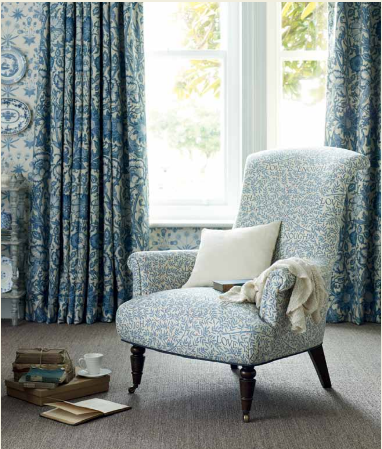
LEFT WALLPAPER Daisy 212561 CUSHIONS FROM FRONT Love is Enough 222519, Pink and Rose 222531 BEDSPREAD Jane's Daisy 230345, BEDLINEN from the Sanderson Bedlinen Collection THROW (on basket) Woodford Plaid DHIGWP304 WOODWORK Sanderson Crystal Grey 46-19P ABOVE WALLPAPER Daisy 212561 CURTAINS Pink and Rose 222531, CHAIR Love is Enough 222519 piped in Ruskin DRUSRU314, CUSHION Ruskin DRUSRU317