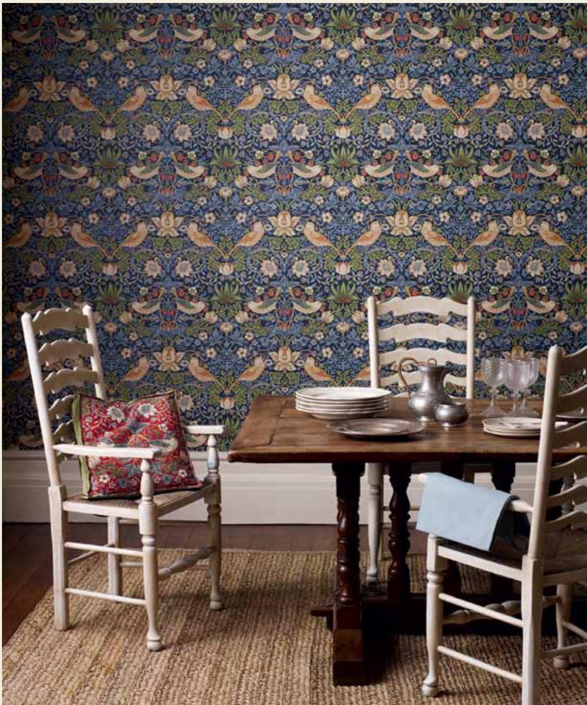
ABOVE WALLPAPER Strawberry Thief 212564 CUSHION Strawberry Thief 220312 bordered in Sanderson Brianza DBRZBR321 WOODWORK Sanderson Quill Grey 47-10M RIGHT CURTAIN Forest 222534 CHAIRS Branch 230279 WALL Sanderson Gale Cloud 30-18D